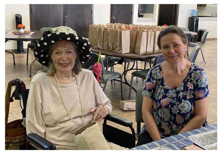
The sack lunch ministry continues to be a great success and occurs on the second Tuesday of every month at 9:30 in Maitland Hall.

If you prefer to make the sack lunches at home, they will gladly be accepted! They can be dropped off to Maitland Hall before 10 A.M. on the second Tuesday.